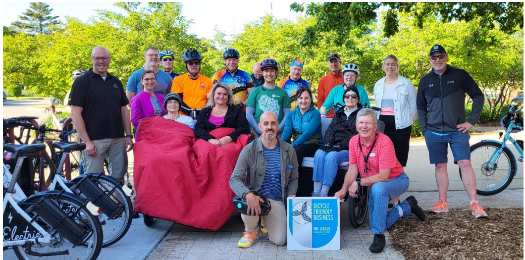
Fitchburg's Bike to Work with the Mayor and Bicycle Friendly Business celebration, May 17, 2024